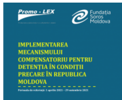
Analiză de Politică Publică nr. 2