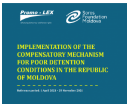
Public policy analysis no. 2